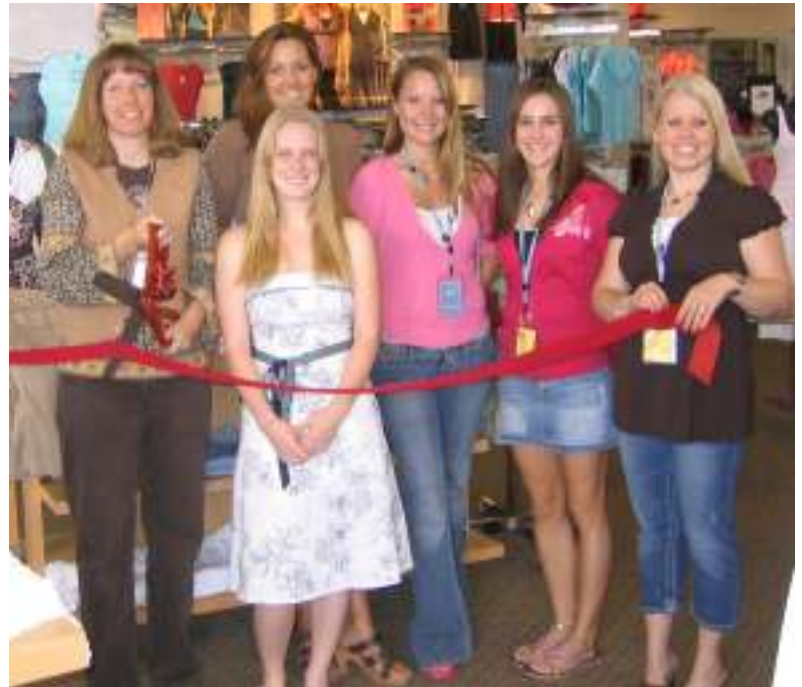
Be sure to stop in and check out their new clothing line!